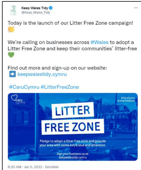
Left: Keep Wales Tidy launch Tweet .