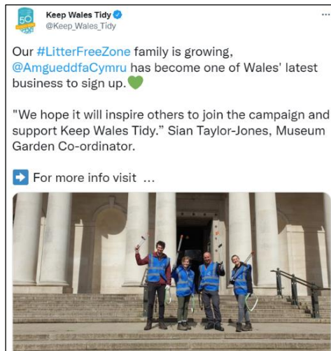
Left: Keep Wales Tidy Tweet to promote the involvement of the National Museum of Wales, Cardiff.