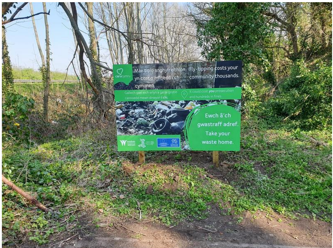
Springfield Road, Gresford