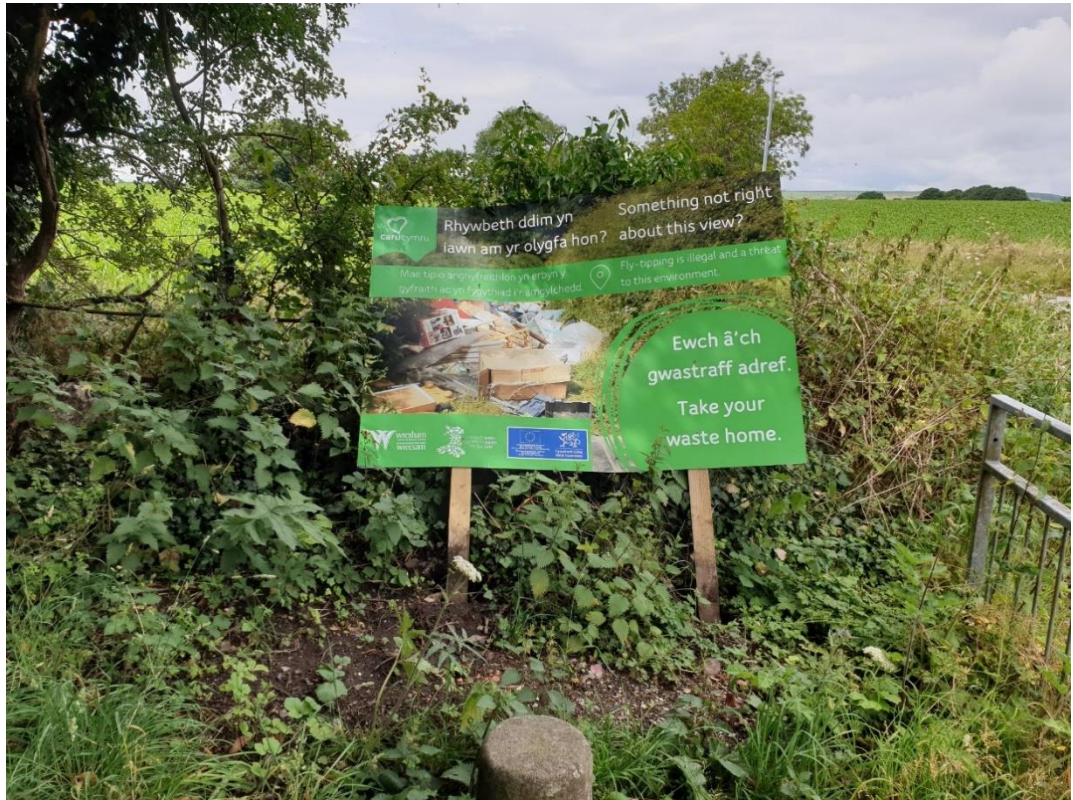
Vandalised sign on Bersham Road which brought the trial to an end