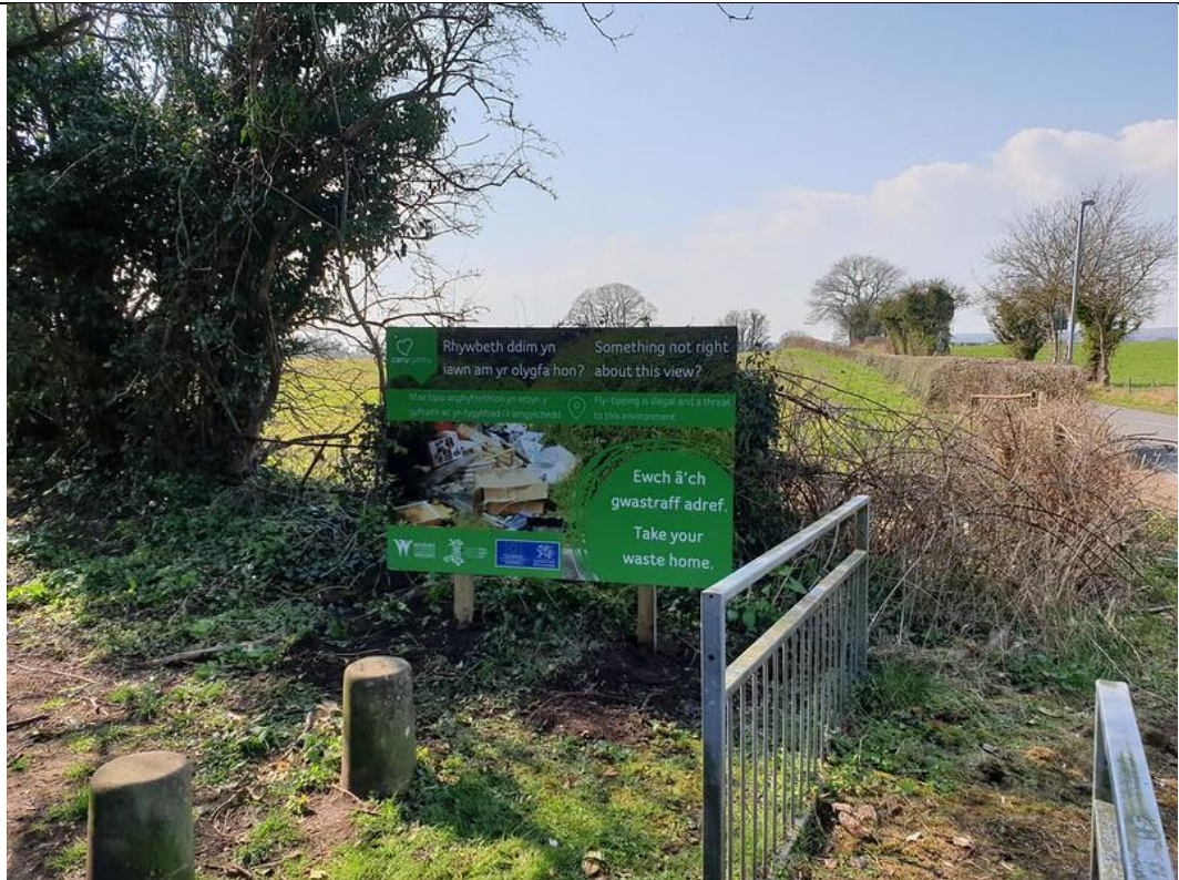
Bersham Road, Wrexham