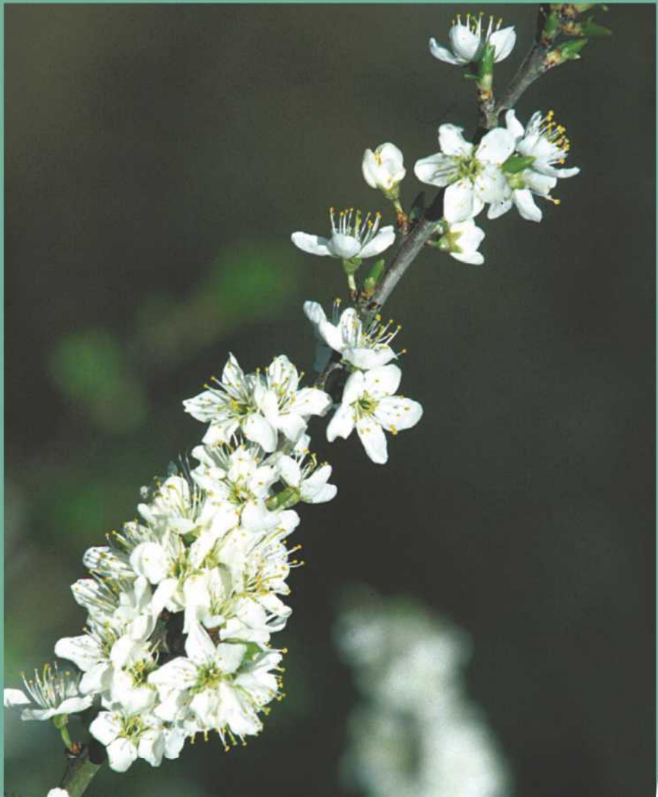
Blackthorn in flower.

years. The majority of insects and other invertebrates that live in hedgerows overwinter in their bases and will be harmed by the cutting of this low-growing vegetation.