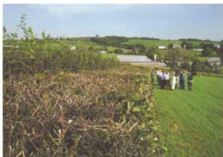
Hedge cut one side only.

But there are exceptions. Partridges, yellowhammers and whitethroats prefer to nest in short hedges, and birds such as lapwing and skylark prefer open landscapes. Hedges should be kept low