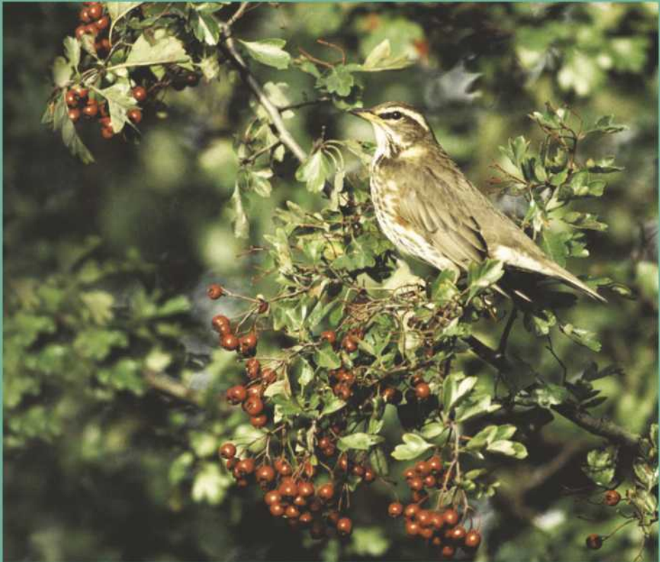
Redwing in hawthorn hedge.

flails and more powerful cutting heads will be required. Flails are available on the market that will cut hedge growth up to 100 mm thick. Alternatively, use a shaping saw (see Q 5).