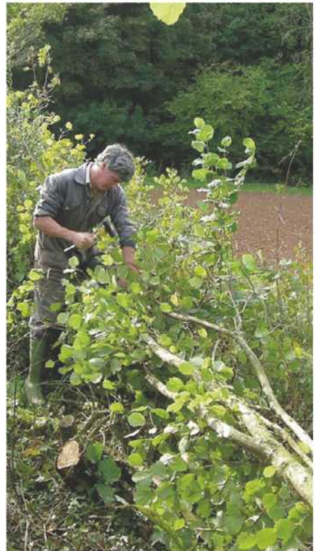
Hedge laying in October.

Raising the cutting height a little each time will reduce damage to branches, as will using a shaping saw or sharp flail