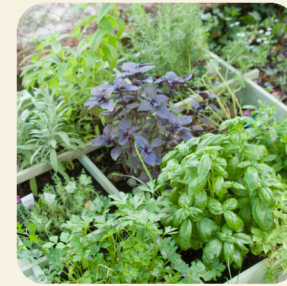
Flowers or herbs