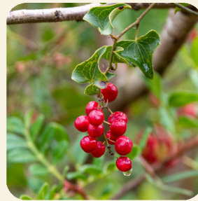
Plants with berries