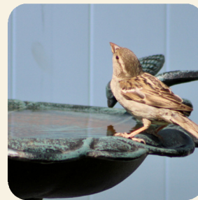
Water for wildlife